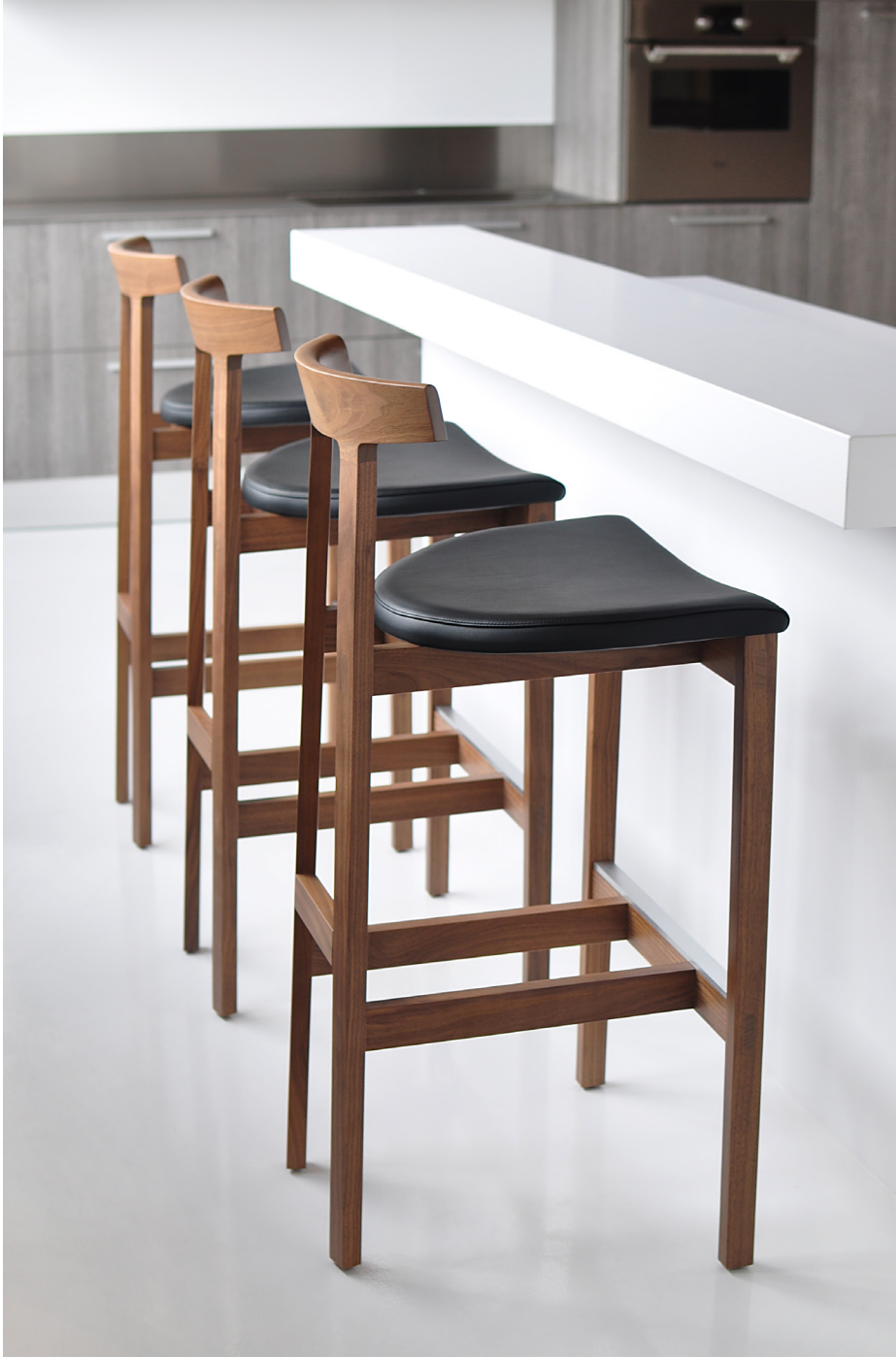
Torii Bar Stool & Counter Stool