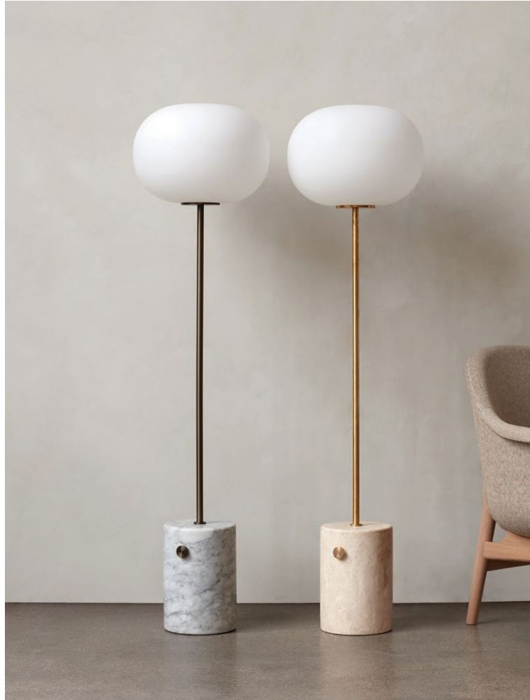
JWDA FLOOR LAMP Designed by Jonas Wagell